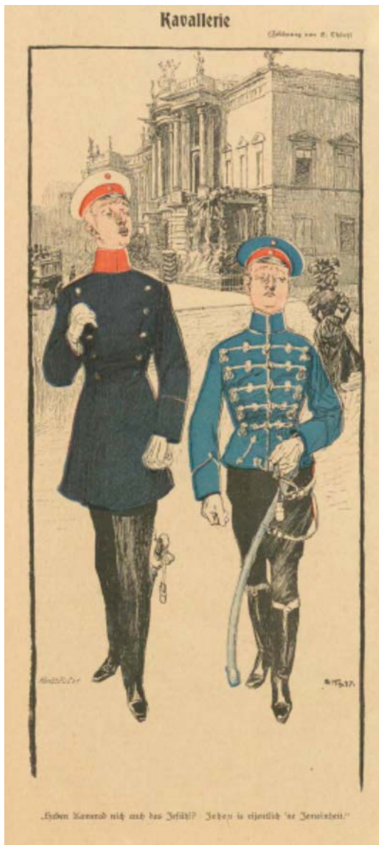
Fig. (4) From Simplicissimus 1897, 2, 27, p. 212; drawing by Eduard Thöny entitled “Cavalry”. The text reads: “Haben Kamerad nich auch das Jefühl? Jehen is eijentlich ´ne Jemeinheit”. (‘Has the comrade the same impression? Walking

The influential contemporary satirical magazine Simplicissimus portrays the Prussian officer as a chauvinistic, stupid, vain, idle, useless and extremely arrogant member of a caste which desperately tried to keep all ‘intruders’ out. Stiff body hexis, often symbolized by the monocle, and the fetish of the uniform combine with a particular verbal style (see the examples in Fig. 3 and 4).