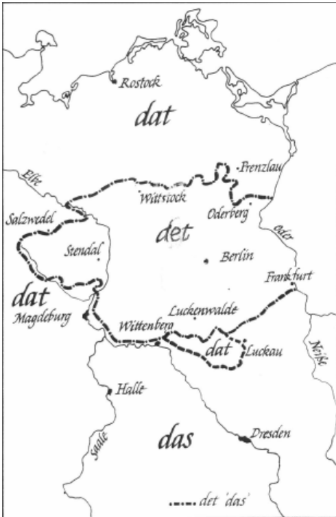
Fig. 3: Geographical distribution of the variants of std. German das (neuter demonstrative pronoun/neuter definite article) around 1900 according to the Sprachatlas des Deutschen Reichs (map from: Schönfeldt 1986: 233).

But in addition to this ongoing shift from Low to High German, another event of longue durée now becomes more important. This is another change from above which begins to exert its influence first on the bourgeoisie, then also on the petite bourgeoisie and the working class: the formation and ideological construction of a national standard variety of spoken German from which all regional features are eliminated. As outlined in the last section, like most other European nations, Germany had a clear prestige variety linked to one particular area, i.e. that of Upper Saxony, until around 1800. The main difference from England, France, Denmark or Sweden was that this area was not that of the capital (which, if anything, would have been Vienna), and that the political and economic power of Saxony did not last. When the economic and political power moved north to Prussia, the cultural and linguistic capital