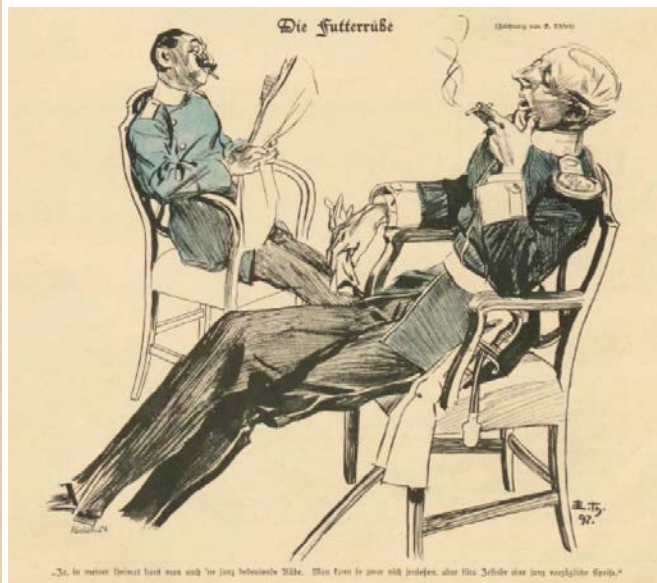
(Fig. 5) From Simplicissimus 1897, 2, 24, 1897, p 189; drawing by Eduard Thöny, entitled “The mangel beet”. The text reads: “Ja, in meiner Heimat baut man auch ´ne janz bedeutende Rübe. Man kann se zwar nich jenieißen, aber fürs Jesinde eine janz vorzügliche Speise”. (‘Yes, in my homeland they